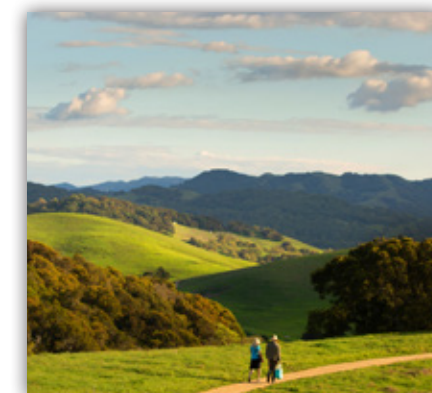
Enjoying nature at Taylor Mountain Regional Park and Open Space Preserve.