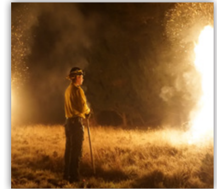
A prescribed fire at Shiloh Ranch Regional Park.

Five Parks' staff members took part in TREX (TRaining EXchange), which brings together fire professionals, land managers and volunteer burners to learn about prescribed burns in different ecosystems, share skills and network. The training was organized by Audubon Canyon Ranch's Fire Forward program. Two parks staff members also participated in Fire Forward's Fire Fellowship, to become even more qualified and, eventually, California state certified "burn bosses." ( continued )