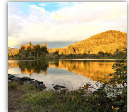
Tranquil view of Spring Lake Regional Park.

The water at the center of the 320-acre park is actually a flood-control reservoir built by the Sonoma County Water Agency from 1961 to 1964. Development as a recreational park began in 1973, (continued)