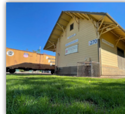
Sonoma's Depot Park will be getting innovative additions