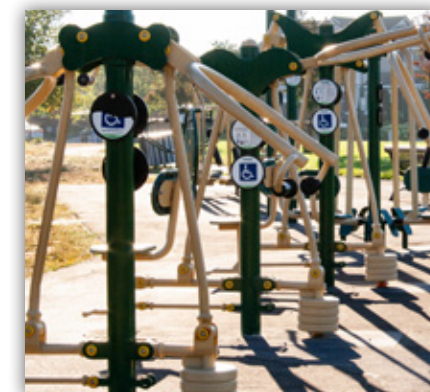
Outdoor fitness equipment was installed in Windsor's Starr Creek Park.

And a total of $45,000 was used for a joint project by the town and Windsor Unified School District to create a new pathway in Sutton Park, improving bike and pedestrian safety in this high-traffic area.