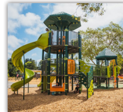
Kotate Park revitalization project wrapped up in Cotati.

The multi-year project, which was completed in September 2023, replaced Cotati's oldest and most outdated playground equipment for both the 2-5 and 6-12 age ranges. It also brought Cotati its first outdoor exercise equipment, creating a healthy option for parents already at the park with their children and for people wanting to go to the park for the sole purpose of being active.