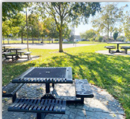
Many of Rohnert Park's picnic tables and park benches were replaced and repaired.

To better meet the needs of its growing population, Rohnert Park is in the process of redoing its outdated Parks and Recreation Master Plan, which was created in 2008 and last updated in 2016. The plan is the guiding document for preserving and enhancing the city's parks and recreation system.