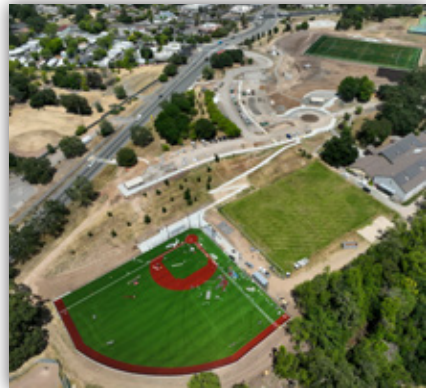
New sports fields at Maxwell Farms.

This year's upgrades include the Sonoma Burger Shack (a lakeside eatery); new tables, barbecue grills and food lockers in the group picnic areas and all campsites; redesigned hands-on activities at the Environmental Discovery Center; and an abundance of fresh asphalt, paint, signage and other improvements.