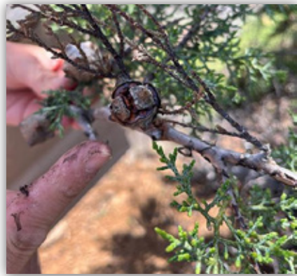
Harvesting Sargent cypress seeds at Hood Mountain Regional Park and Open Space Preserve.

A joint effort by the nonprofit Laguna de Santa Rosa Foundation and Regional Parks is working to restore the unique pygmy cypress forest at Hood Mountain Regional Park and Open Space Preserve.