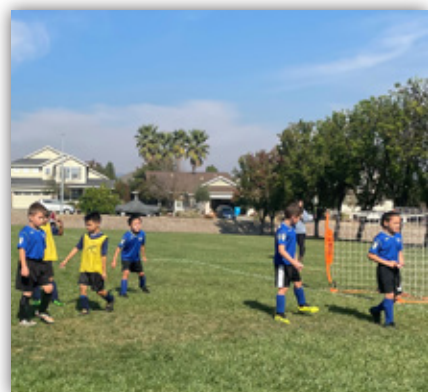
Kids play soccer at the refurbished Furber Park in Cloverdale.

Adding a third staff member helped the crew provide safe and inviting recreation areas with better responses to maintenance issues, including providing park and landscape services throughout the city. This helped them meet the expanded maintenance required to support the recently added public restrooms in Park Plaza, new pickleball courts at Furber Court and new basketball courts at City Park.