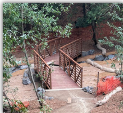
A new bridge spans a seasonal creek in Healdsburg's Fitch Mountain Park and Open Space.

Healdsburg is combining $200,000 of its fiscal year 2021/22 and fiscal year 2022/23 Parks for All/Measure M funds with other state and city funding to complete the Fitch Mountain Access Improvement Project.