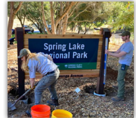
A Regional Parks crew installs a new sign at Spring Lake Regional Park.

As part of its 50th anniversary celebrations, Spring Lake Regional Park was selected to be one of the first parks to roll out these new designs. In addition to the entrance signs, new signage will be installed throughout the park by the end of 2023.