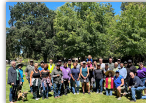
Santa Rosa's Park a Month volunteers spruce up Julliard Park.

Santa Rosa used its fiscal year 2022/23 Parks for All/Measure M funds for a variety of purposes. As part of an ongoing effort to enhance both the aesthetics and safety for many play areas, $22,000 paid for installing engineered wood fiber surfacing material at various playgrounds.