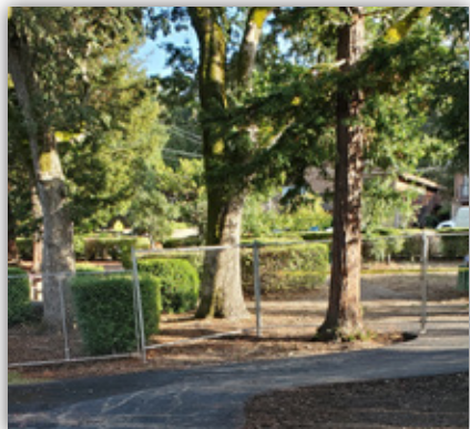
AmeriCorps Trail was extended in Sebastopol.