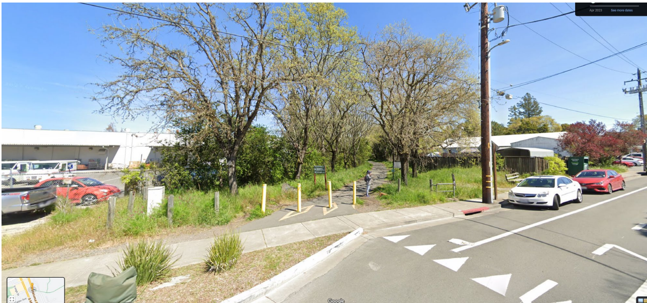
Petaluma Avenue facing east t to site