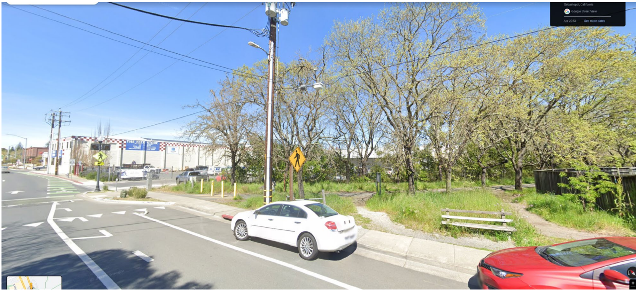
Petaluma Avenue facing east t to site