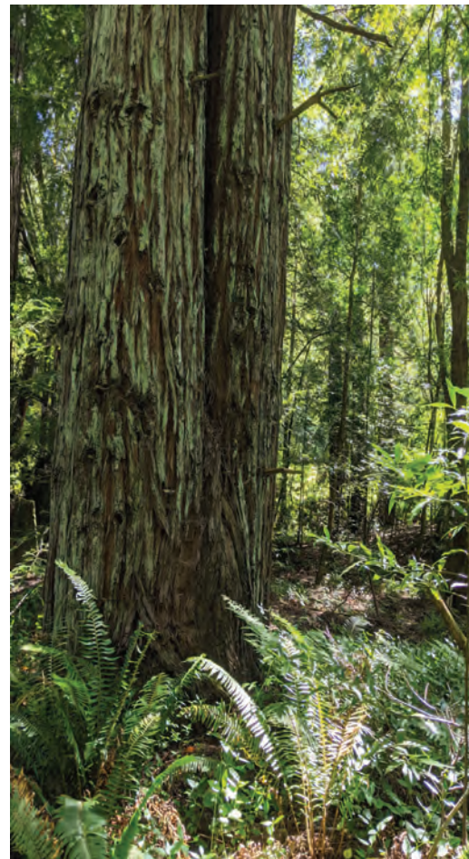
Ancient redwoods and douglas-fir

The 10-space parking lot provides off street parking access while participating in park staff guided hikes of the 1.8-mile loop trail.