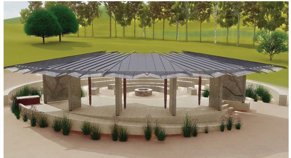
STAGE CONCEPTUAL DESIGN