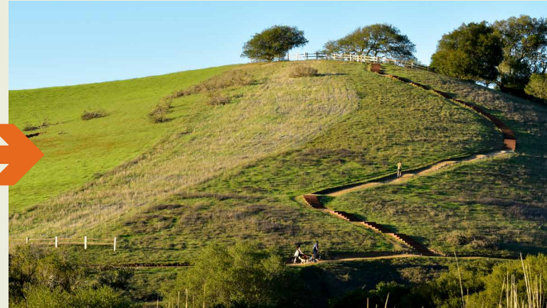
After: The Panorama Steps offer the same climb without causing erosion into San Antonio Creek.