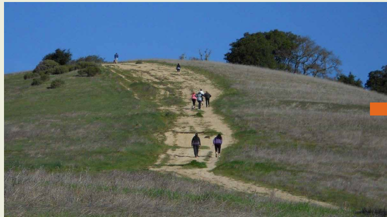
Before: This steep, now-decommissioned trail had grown to become 80 feet wide at its widest point.