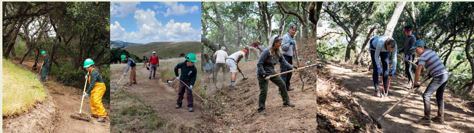
These improvements would not have been possible without the hard work of the Redwood Trails Alliance, Conservation Corps North Bay, Sonoma County Regional Parks staff and community volunteers.