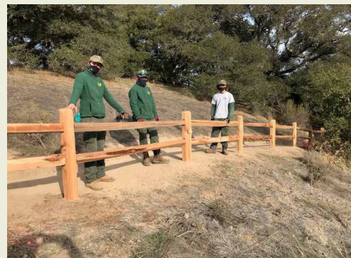
Youth crews installed fencing to discourage trail shortcutting.