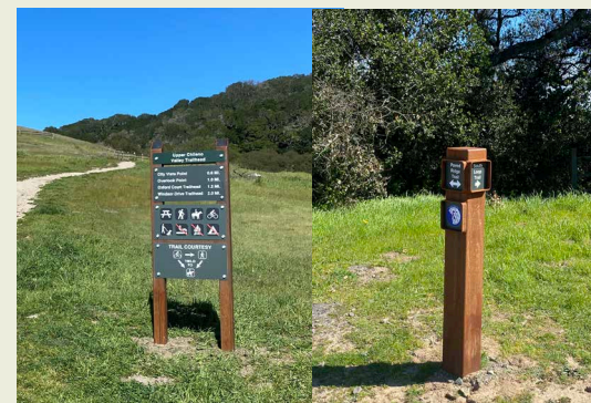
New trail signs were installed throughout the park.